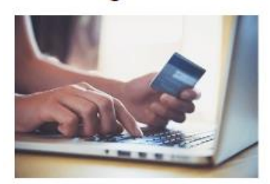
Debt Statutes of Limitations for Every State